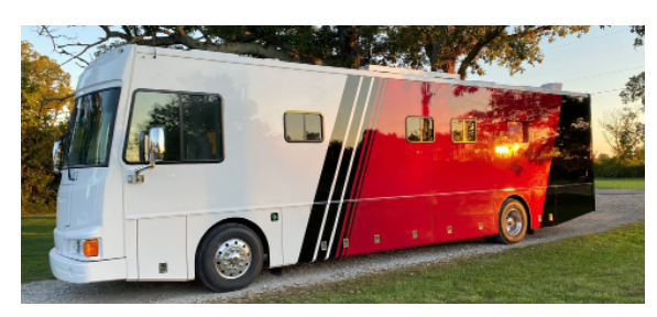
The Palmetto LEADER arriving soon!

October 15, 5-6:30 PM October 19, 7-8:30 PM. October 24, 12-1:30 PM